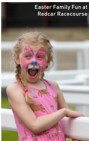
Easter Family Fun at Redcar Racecourse

For tickets and race start times, visit www.redcarracing.co.uk