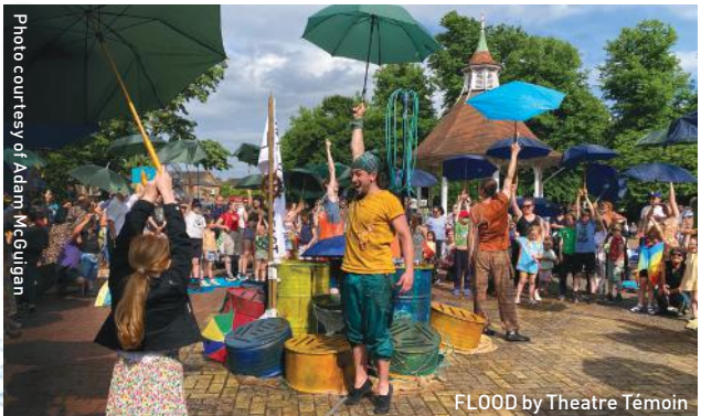
FLOOD by Theatre Témoin

The first outing of Redcar's flagship festival of adventure, exploration, imagination and messiness for the children, young people and families of Redcar and Cleveland and beyond. Expect performances, puppets, and even a giant!