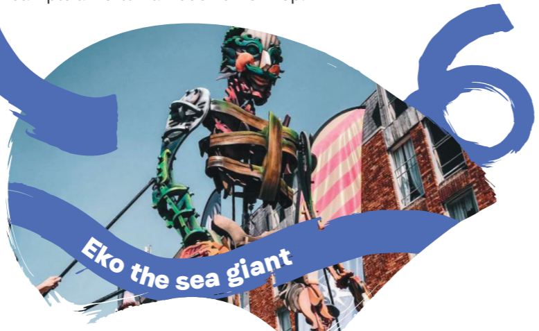
Eko the sea giant

Fish & chips? Rude not to! And, of course, don't forget to sample a world-famous Lemon Top.