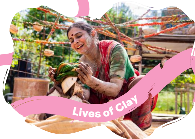
Lives of Clay